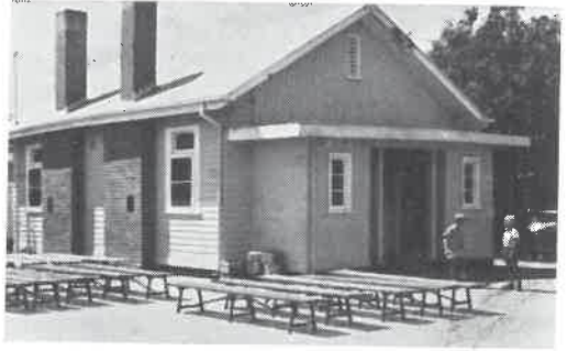
CAFETERIA — PRIMARY SCHOOL

tion. (This cookery room was later used as a Cafeteria for the Primary School).