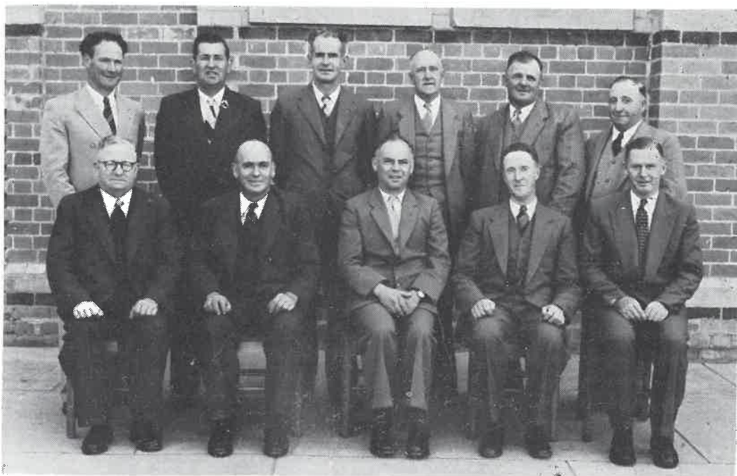
EARLY ADVISORY COUNCIL, 1954