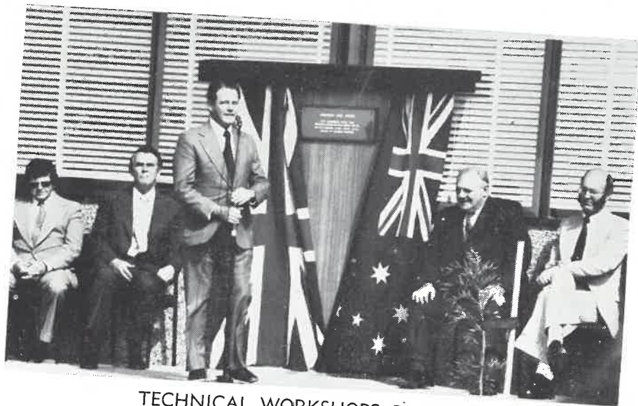
TECHNICAL WORKSHOPS OPENING 27th MARCH 1975

Numurkah students seem ready to recognize education as a many sided set of experiences involving, work, play and a helping hand for those in need. We would be glad to see this attitude prevail into the following fifty years of our school's history. We trust that many of today's students will be the ones who will make that evaluation in the year 2024 A.D.