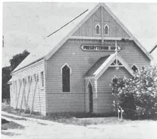
PRESBYTERIAN CHURCH HALL