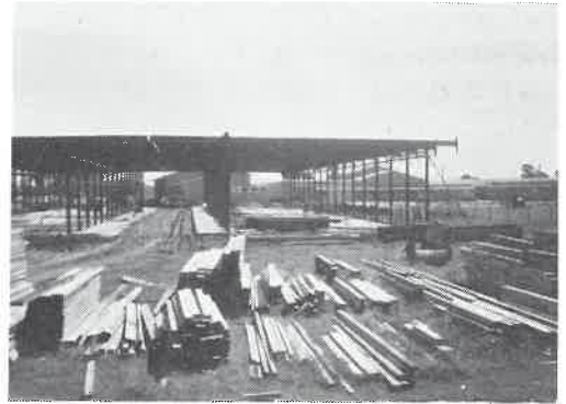
TECHNICAL WING UNDER CONSTRUCTION