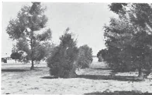
NEW TREES ESTABLISHED 1972-74

Over the years the school has had many Conferences, Speech Nights and parent evenings usually highlighted by the presence of noted guest speakers. Deputations have also on many occasions taken some of our prominent citizens to Melbourne to put a local need or point of view before the Minis-