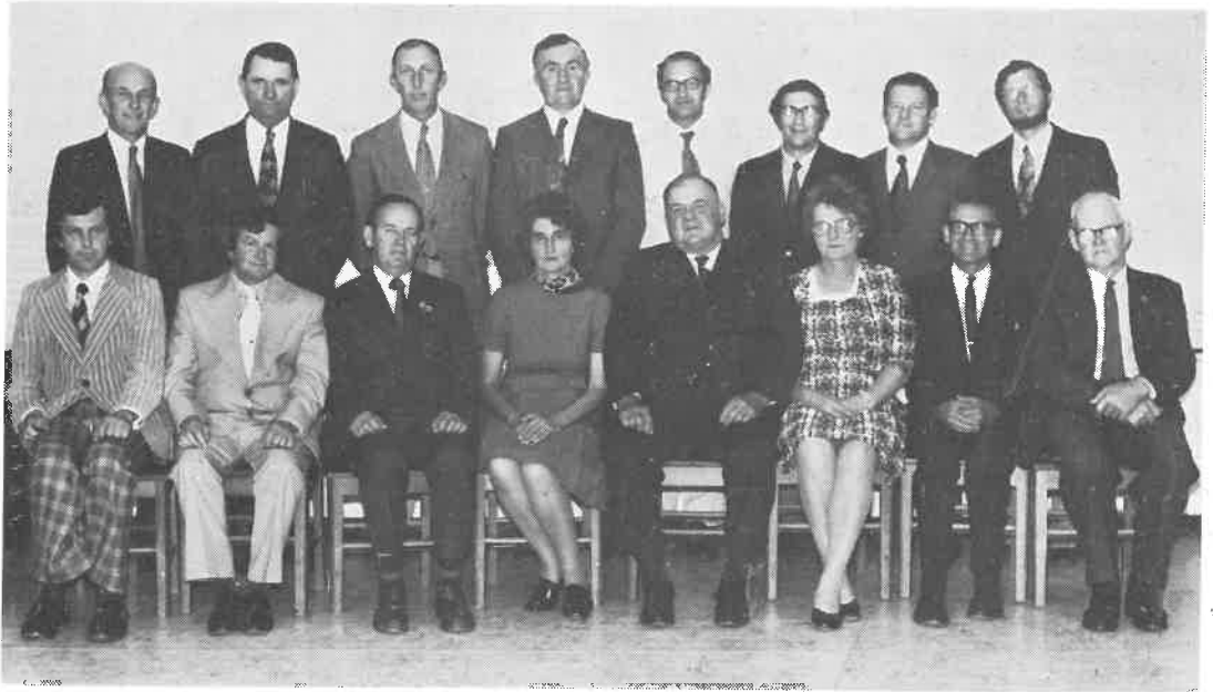
ADVISORY COUNCIL 1974

(Maintenance), Fitting and Machining, Motor Mechanics (owner driver course), Leather craft, Pottery, Art, Dressmaking, Typing.